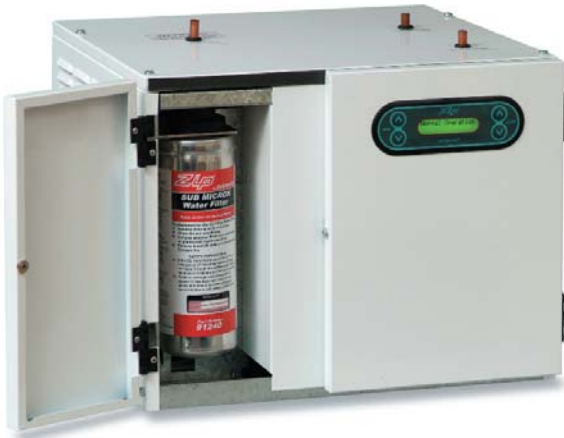
Undersink Unit with filter compartment

Zip HydroTap® Instant Boiling and Chilled Filtered Water Under-Sink Commercial Models