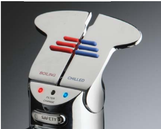
Over-sized levers available for people with restricted dexterity (optional accessory)